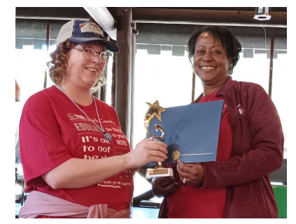
Largest Team: The Pacemakers