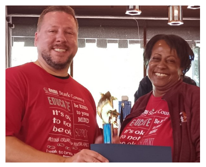
Top Fundraising: Team Lightell