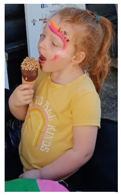
Fun for all ages!